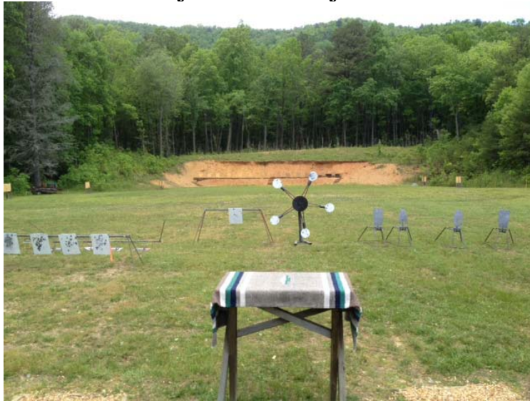
Texas Star Target